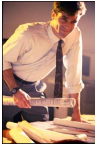
Build precise estimates quickly with powerful Estimating tools From Sage Timberline Office.

The accurate estimating of projects is both the most difficult and most essential part of a successful construction or trade business. Fluctuating material and labor costs and the large number of variables involved, make arriving at an accurate estimate a challenge for even the most experienced estimators. To achieve profitability and overall business success precise estimates are essential. Now, in addition to Sage Master Builder Estimating Basic, Sage Master Builder users now have more options. In addition to Sage Master Builder Estimating Basic your Sage Master Builder system now integrates with industry-leading solutions from Sage Timberline Office Estimating— Sage Master Builder Estimating Standard and Sage Master Builder Estimating Extended .